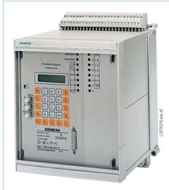
Fig. 11/106 SIPROTEC 7VE51 paralleling device